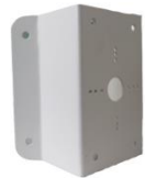
HIA-B201 Corner Mounting Bracket